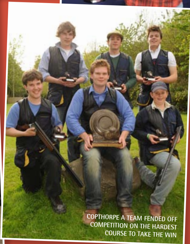
COPHTHORPE A TEAM FENDED OFF COMPETITION ON THE HARDEST COURSE TO TAKE THE WIN